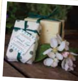
Avocado Relaxing & Balancing