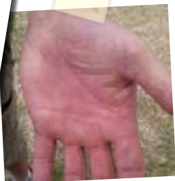
June 2014 - After