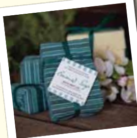
Avocado Working Hands

Our skin holds our bodies together, shielding us from the outside world. It is our protective covering, our first barrier to fight illness and disease, and a passageway to our bloodstream.