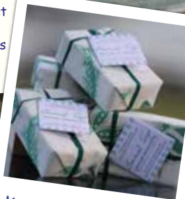
Memories of the Beach