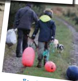
Beach clean (Camas nan Geall)

Emma's Soap was designed out of necessity, to create a product that did not scar our environment from the ingredients to the packaging. As the business is growing that ethos is the key in every decision made.