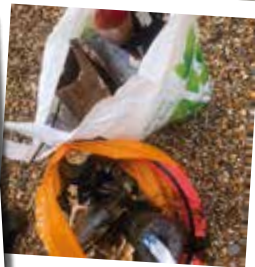
Blackpool Sands - South Devon