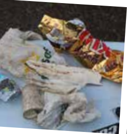
Torbay - South Devon