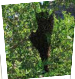
A large swarm!