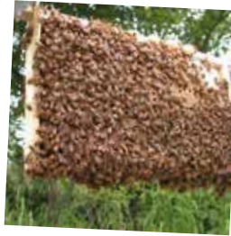
Bees On a frame

Looking after bees, working in harmony with a colony, only taking a little honey and leaving enough natural food for the colony is an enjoyable, essential environmental contribution.